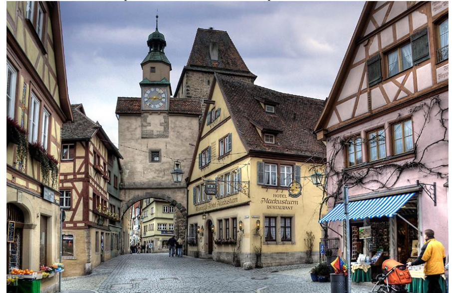
The medieval town of Rothenburg, one of the jewels on the Romantic Road

tours@pauwelstravel.com - www.pauwelstravel.com