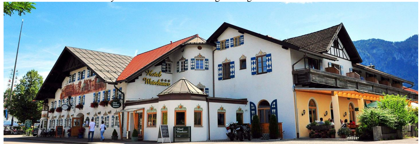
Hotel Weinbauer in Schwangau

In the afternoon we enter the Allgaeu Region, a.k.a. as the Bavarian Alps. Our destination is the picturesque village of Schwangau near the town of Fuessen, the southern terminal of Germany's Romantic Road. Dinner and overnight in a traditional Bavarian inn, the Weinbauer (/www.hotel-weinbauer.de), located within view of one of the world-famous "fairy-tale castles" of "Mad King Ludwig"!