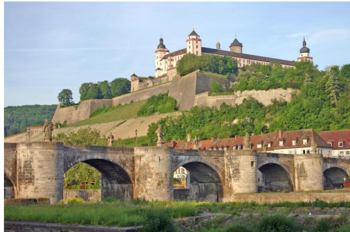
Jewels of the Romantic Road: Dinkelsbühl and Würzburg

<u>Day 10 - Friday, April 26</u>: Morning walking tour of Würzburg, with sights such as the medieval bridge across the Main River, decorated with statues and offering views of the Marienberg Fortress on top of a vineyard-covered hill, the wonderful Romanesque Cathedral, and the Residenz, the exuberant baroque palace of the prince-bishops who used to rule this city, decorated by superb frescoes by Tiepolo and classified as a UNESCO